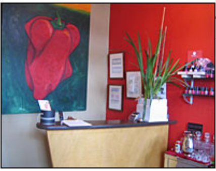
Enlarge The décor is lively and bright at the Capitol Hill Wax On.